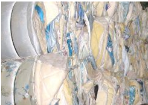
Foam and mattress toppers