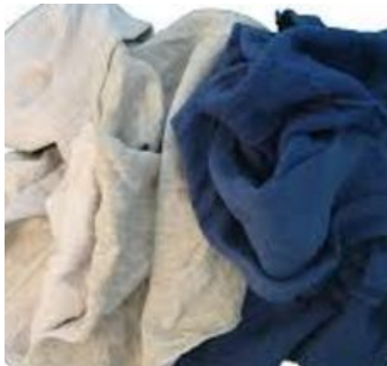
Damaged hoodies, torn plaid shirts